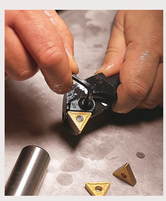
Reduced allergic reactions