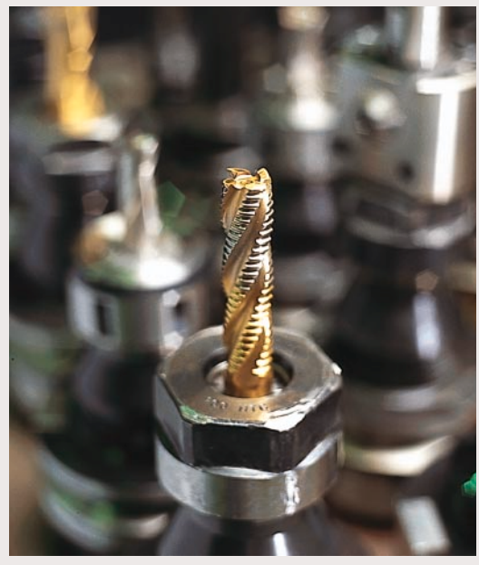
Reduced tool wear