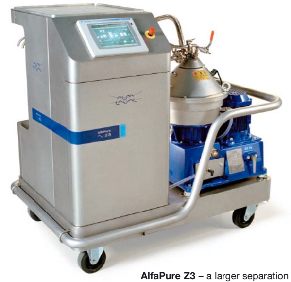
AlfaPure Z3 – a larger separatio system from Alfa Laval.

Our total product range includes some 20 separators that also treat wash liquids, oils, other emulsions and paint waste. Alfa Laval is also the world's leading supplier of heat exchangers, helping customers around the world heat, cool and transport any type of fluid.