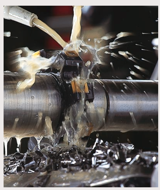
No more sticky tools